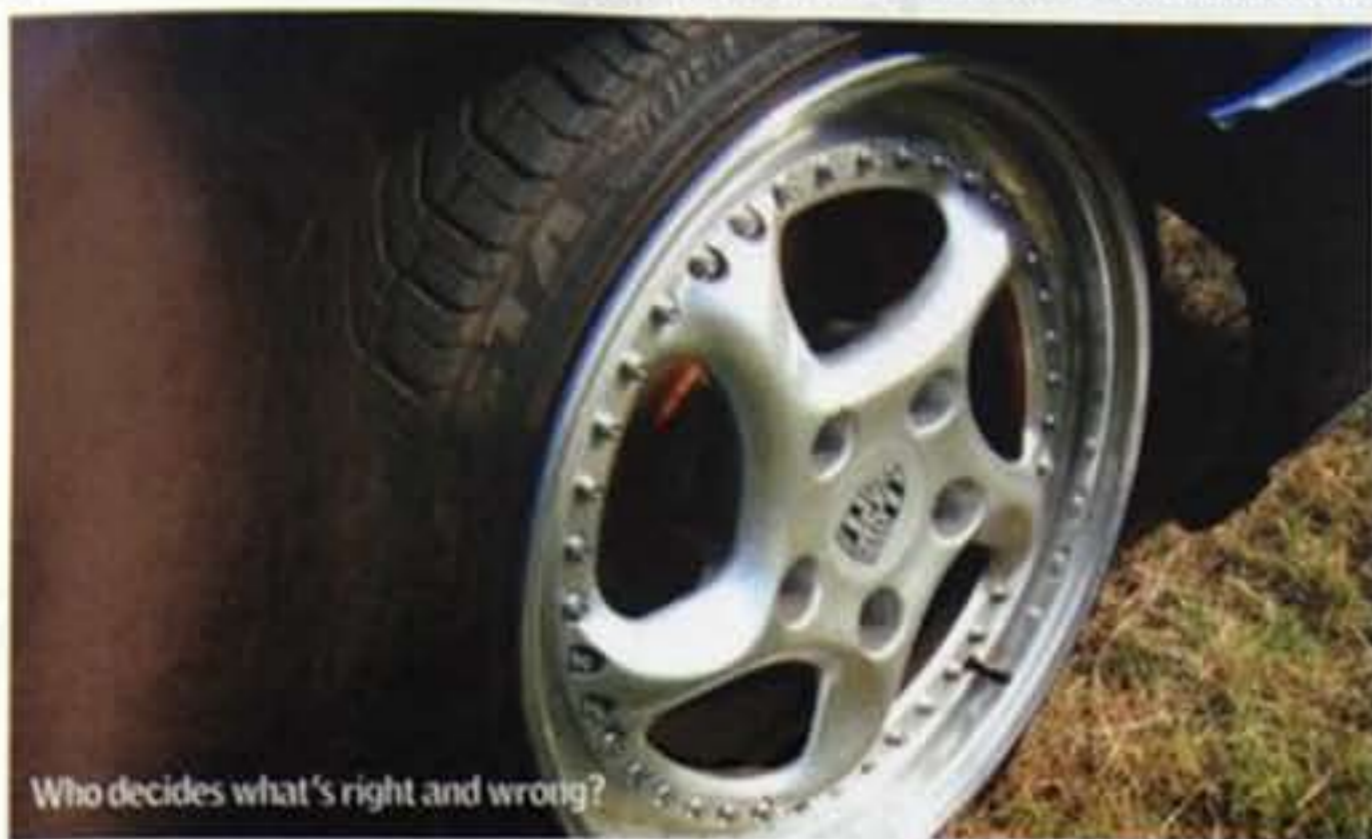
Who decides what's right and wrong?